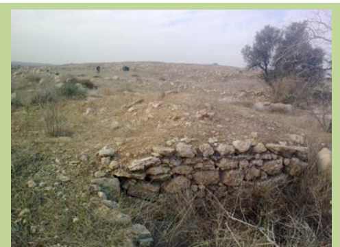
'South Africa Forest' is a JNF-funded project in the lower Galilee that has been planted on top of the remains of a destroyed Palestinian village, Luby.

In many countries through out the world the JNF receives charitable status –its ethnic cleansing activities benefit from tax exemptions. From South Africa, let's join the global drive seeking to: 1) challenge the greenwashing tactics of the JNF; 2) expose the JNF's racist agenda and policies; and 3) have the JNF's charitable status revoked!