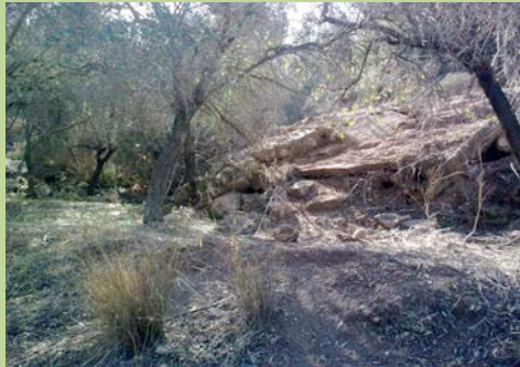
A bulldozed Palestinian home in the destroyed village of 'Imwas', now in 'Canada Park', illegally annexed by Israel in 1967.

In recent times, the JNF has recognised the propaganda value of going green and has rebranded itself as an environmental NGO. It attended the Johannesburg Earth Summit and the Climate summit in Cancun. It is expected to participate in Rio+20 in 2012, promoting its greenwash to conceal its human rights abuses.